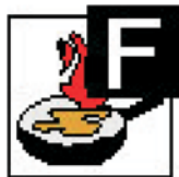
Powder extinguisher with D powder

Fires involving metals (e.g. magnesium, aluminum swarf)